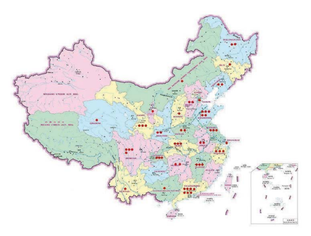
Figure 1 Geographical distribution of 59 retained studies during 1980–2011.